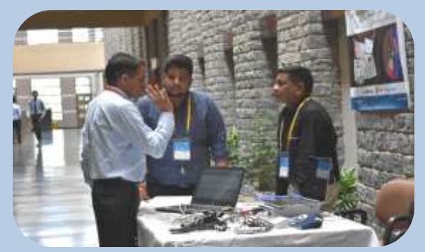
PowerLab, Delsys Trigno Wireless system, Equivital Wireless system, Wireless ancillaries,

PowerLab is a data acquisition (DAQ) device engineered for precise, consistent, reliable data acquisition that are capable of recording at speeds of up to 400,000 samples per second continuously to disk (aggregate), and are compatible with instruments, signal conditioners, and transducers, etc.