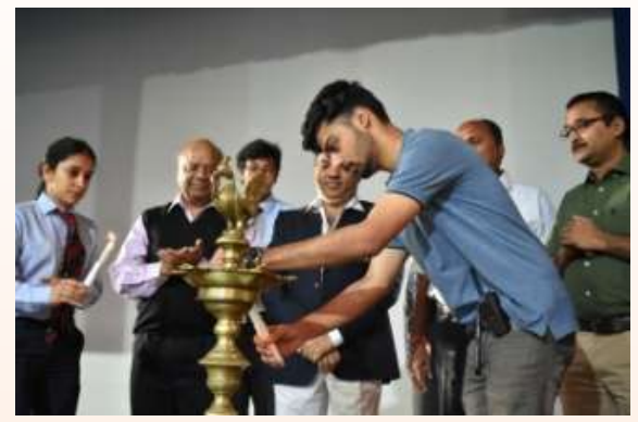
and an oath-taking by the players. About 250 students accompanied by their coaches/referees from various colleges across India, including Chitkara University, PEC, IIT Ropar, UIET and

Jaypee University of Information Technology hosted its annual sports fest - "Parakram" on the 4th-5th of October. The fest was declared open after a traditional lamp lightening by the guests