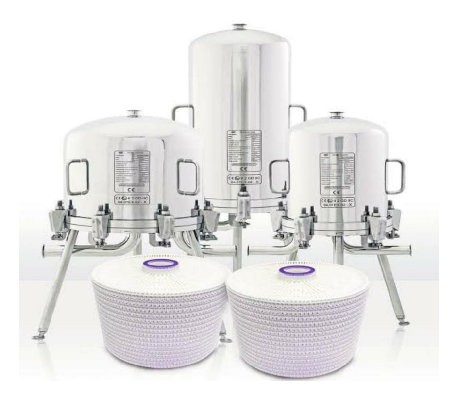
Supradisc second moduole