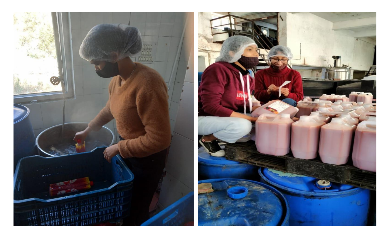
Packing and Labelling of Tomkin Sauce