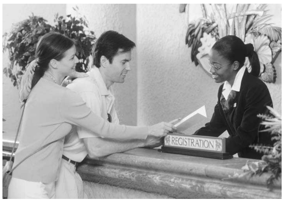
Strong listening skills are especially important in service industry careers.