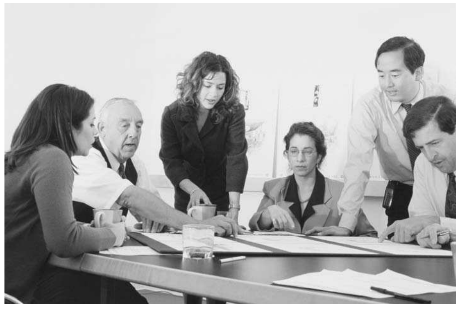
An effective meeting combines all types of communication skills.

50 percent of the productivity of the billions of meeting hours is wasted." Why? Poor meeting preparation, they explain, and lack of training on how to conduct meetings effectively are the culprits. As a result, employees tend to tune out and fail to participate. A well-run meeting combines the writing, speaking, and listening skills that we've been discussing in this book. Whether you're leading a meeting or are just a participating in one, you need to communicate clearly.