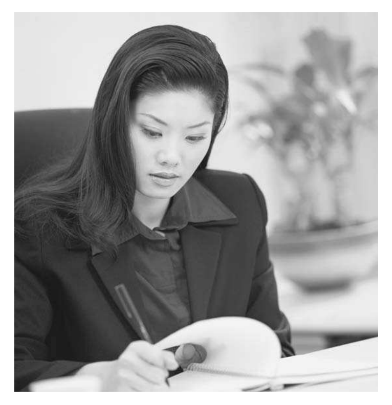
When writing a work memo, be sure to have a clear purpose and state that purpose as quickly as possible.

arrives through email, fax machines, and overnight delivery. With so much information coming in, managers don't have time to read all of it. Often they will stop reading a memo if it doesn't capture their interest quickly.