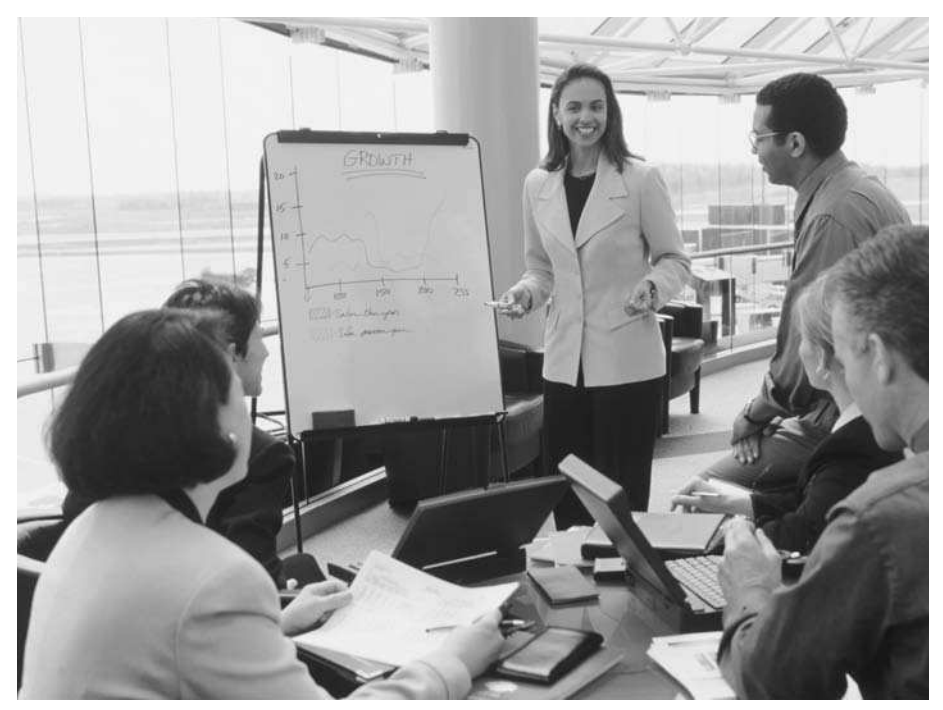
Public speaking is a very important workplace skill. You may often be required to present information and your ideas to your managers and coworkers.

Yet most people are afraid of public speaking. In fact, recent polls indicate that they fear it more than death itself.