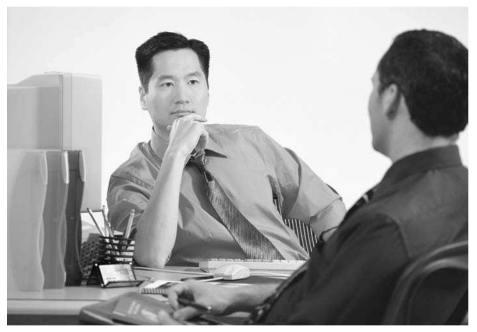
Being a good listener will expose you to new ideas and viewpoints—and help you do your job better.

To stay focused during a long presentation, it also helps to take notes. You don't have to worry about all the details; just listen for the main ideas and write them down. This will help you to concentrate and avoid becoming distracted. Some presentations are followed by question-and-answer sessions. It's often a good idea to formulate questions while you