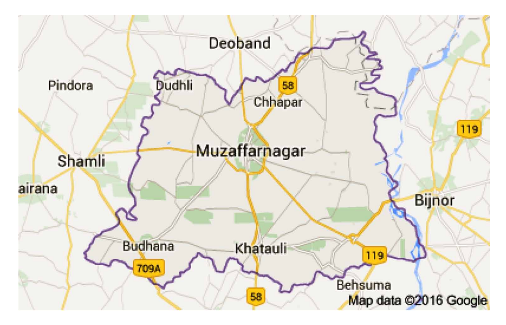
Figure 1. Location map of Muzaffarnagar, Uttar Pradesh