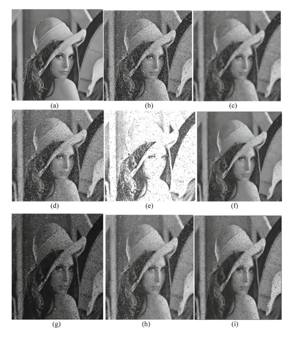
Fig. 3 a Original Lena image. b Noisy image (speckle noise = 10%). c Frost filtered image. d PM filtered image. e DPAD results. f OBNLM. g ADMSS. h Guided filter. i DMF