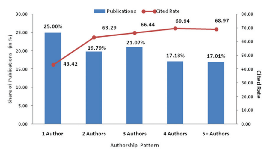
Figure 2. Authorship pattern of drones' publications.

Collaborated studies are important to bring different thoughts, dimensions and aspects of any study. The author collaboration measured with multiple-authorship publications against single-authorship publications. In this study effort to assess the degree of author collaboration was also made. The degree of author collaboration was computed with a following mathematical formula used by Prof. K Subramanyam<sup>24</sup>.